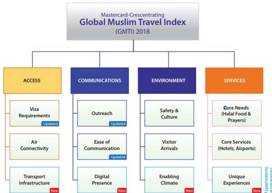
Figure 2. Measurement of GMTI 2018 [3].

index, the measurement of the halal industry comprises access (10%), communications (15%), environment (30%), and services (45%).